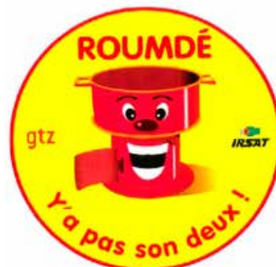
Photo 1 ICS Roundé label

Regarding Roundé stoves for breweries, over 2,300 stoves were built in the first quarter of 2013. Currently, about half of all breweries in Ouagadougou and surroundings (49%) and in the urban area of Bobo-Dioulasso (54%) own an ICS. Although this may suggest that there is still scope for expansion, in practice the uptake of ICS has shown a decline since 2012. Most likely this reflects the