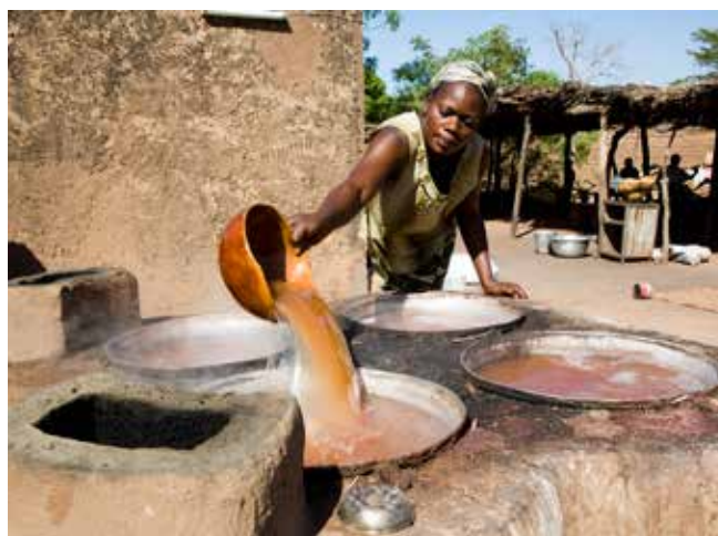
Photo 2 A beer brewster busy making dolo in large cooking pots on a clay stove

Most of the local brewers (57%) produce the beer ( dolo ) using a single stove. Among the breweries that produce with more than one stove and own an ICS, 85% uses the improved stoves.